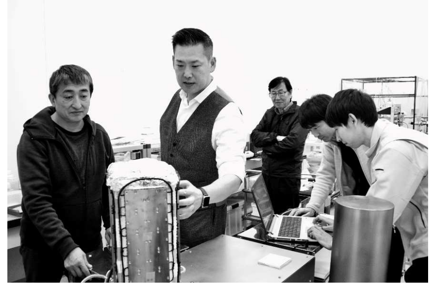
The Clean Planet & Tohoku University Team conducting R&D in the lab

With this capital alliance, the Mitsubishi Estate Group and Clean Planet will create sustainable global community with the new clean energy and will contribute to the creation of human-friendly cities.